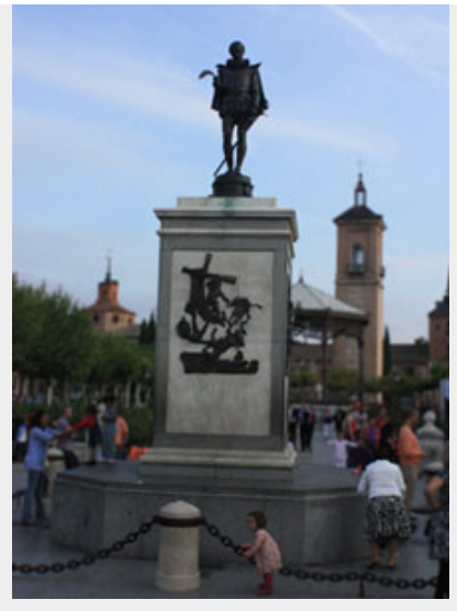
Cervantes in Cervantes Square

You can imagine Alcalá is proud of this fact, and therefore he appears all around the city. Let's have a look at some of his most important appearances!