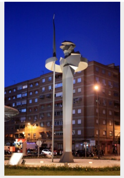
Statue of Don Quijote in Vía Complutense

These are the best known Cervantes references in Alcala, but there are plenty more of them throughout the city.