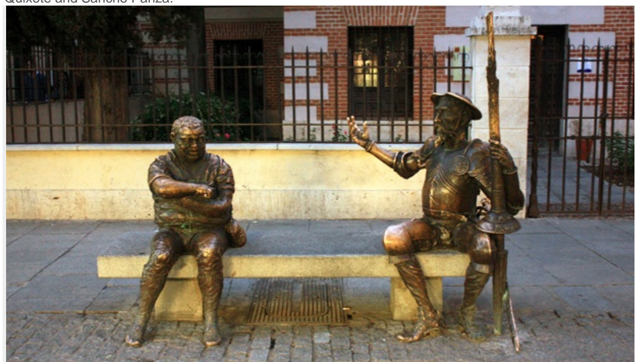
Don Quijote and Sancho in Calle Mayor, waiting for you to take a photo with them.

At the front entrance of the Cervantes Birthplace Museum, you'll find a charming statue of Don Quixote and Sancho Panza . They welcome you, and invite you to sit with them and snap a picture. In fact, it's a must: when you visit Alcala de Henares, you have to take a photo with Don Quixote and Sancho Panza.